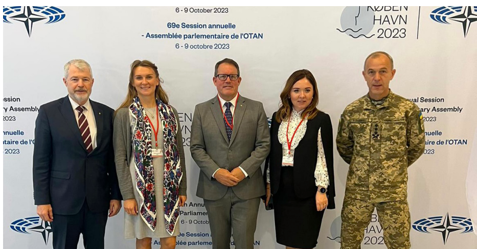
Image: With the Ukrainian delegation in Copenhagen in October last year.

I have been deeply disappointed by the Albanese Government's appalling management of the Taipan helicopter fleet's retirement.